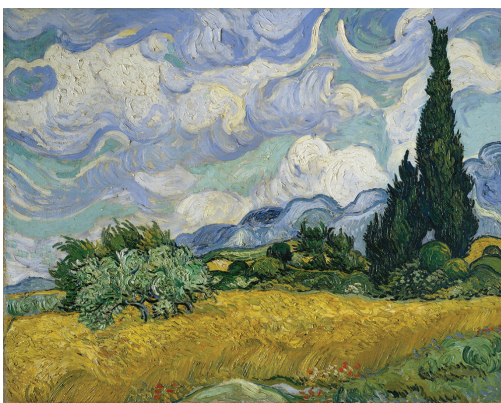
painting: Vincent Van Gogh